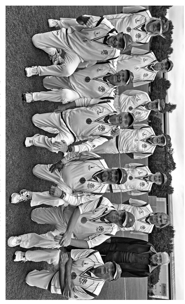
Camb's & Hunts Over 70's Bowl Winners 2024